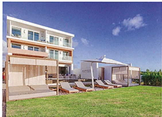
TOP The upper level bedrooms each have ocean-facing balconies offering sweeping view of Meads Bay.